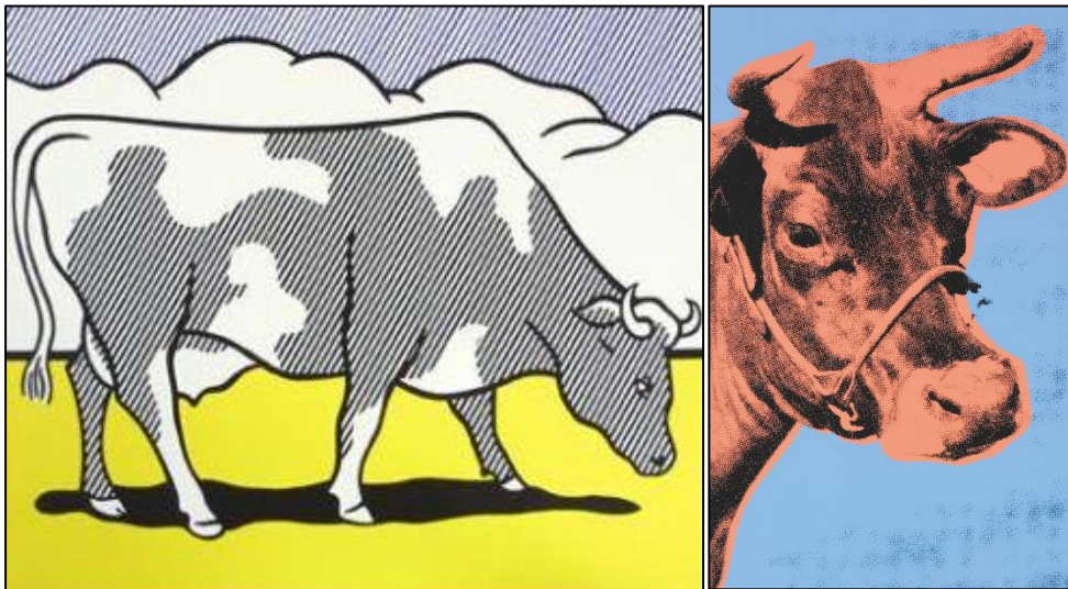
Examples of silk screen prints by Roy Lichtenstein & Andy Warhol

Over the next four sessions you will be introduced to the Silk Screen Printing technique. This is a process that is widely used to produce posters and t-shirts and gained popularity during the 60's when artists such as Andy Warhol and Roy Lichtenstein used it to produce their unforgettable Pop Art pieces.